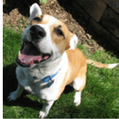
Red Dog Spa spokesdog, Pete, sez: "Red Dog Spa is the best!" (Now, can I have my cookie?)

Many of our vendors "pay it forward" by contributing a percentage of their sales to us to support rescue organizations and local humane societies in their communities. This means that your Red Dog Spa purchases have twice the impact in helping support abandoned and abused pets and pet-related causes, like spay and neuter programs, throughout the U.S.